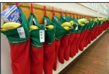
Christmas stockings were hung by the nurse's station with care...and were filled with seasonal fruits and vegetables, thanks to a donation by the Women of the Beckwith United Methodist Church.