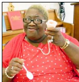
What wonderful treats! Snow cones were prepared for participants and even a traditional Christmas dinner was held on "Christmas Day" of July 25 th .