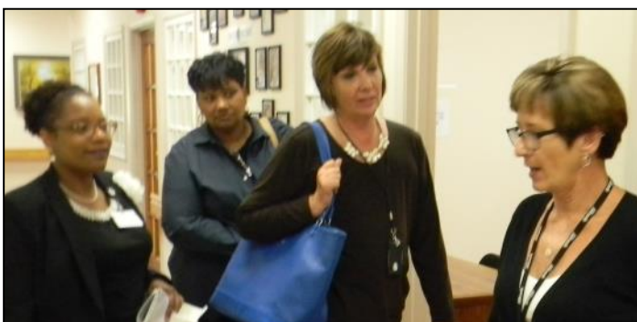
Pleasant Day hosted a Continuum of Care meeting consisting of professionals from Shore Health Systems, Amedisys, Coastal Hospice and others. Pleasant Day staff then gave a tour of the facility to their guests and concluded with a light lunch.