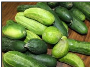
A salad made of fresh cucumbers from Pleasant Day garden, along with tomatoes, onion, and salad dressing were served every Monday in August for participants.