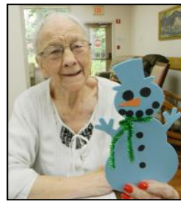
Constructing Santa cards and cutting out snowmen were some of the winter activities held during the month-long celebration of Christmas in July. (Feeling cooler and cooler!)