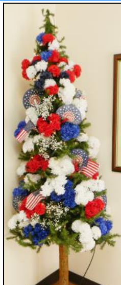
USA Tree decorated by Roz Wallace.