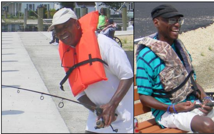
Several of the male participants of Pleasant Day held a Men's Fishing Trip to Long Wharf. The fish were few, but the fun was abundant.