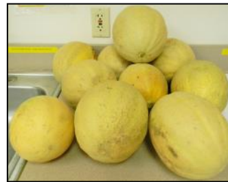
Thank you to Tolley's Catering for preparing all of the fresh produce every day in August for the lunches provided to participants.