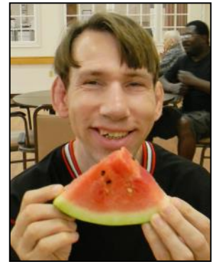
A summertime staple treat, watermelons were served Wednesdays in August.