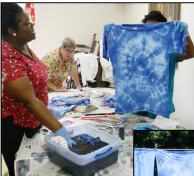
In preparation for the annual trip to Ocean City, Pleasant Day participants helped tie together T-shirts to dye for them to wear during the trip. Everyone received a shirt with a unique pattern.