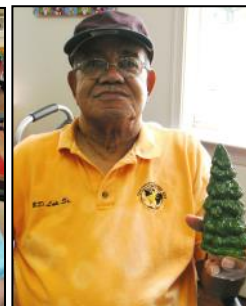
Ceramic Christmas trees with LED lights were hand painted and fired, resulting in wonderful decoration pieces for participants to carry home with them.