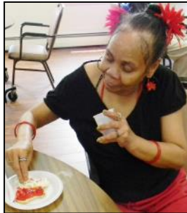
Participants used frosting and sprinkles to decorate their own Christmas cookies. The cookies were donated by Bay Country Bakery. Mmm...Mmm... Good!