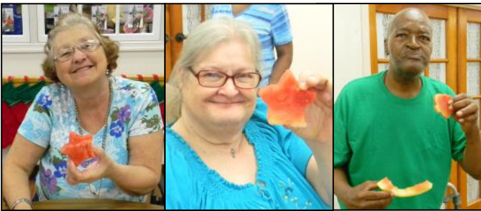
Above: Putting a unique twist on traditional Christmas traditions, participants punched out stars and trees out of fresh watermelon with cookie cutters. Christmas never tasted so good!