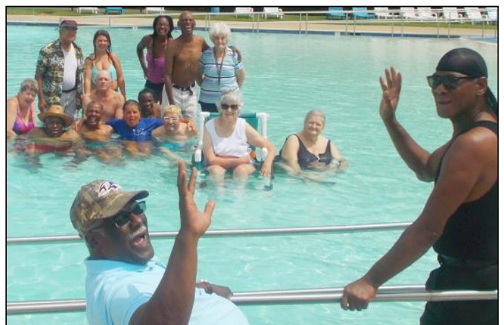
Pleasant Day participants cooled down from the hot summer sun by having a dip in the Dorchester County Public Pool!