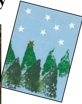
Pleasant Day participants used sponges and star stickers to create hand-made greeting cards that will be sent to doctor's offices and other health care facilities in December.