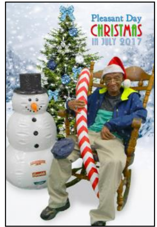
Participants braved the cold to pose with a snowman for a special Christmas in July photo. Participants found framed prints in their Christmas stockings to take home with them.