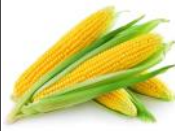
Pleasant Day Participants shucked and ate savory corn on the cob, creamed corn, corn fritters and corn salad courtesy of Emily's Produce.